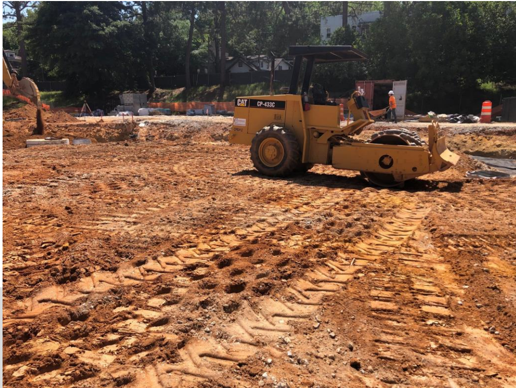
Prepping parking lot for New Addition