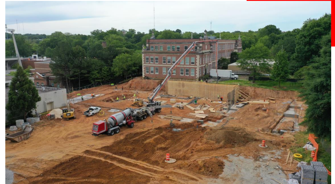
Pouring Concrete at South Wall of New Addition