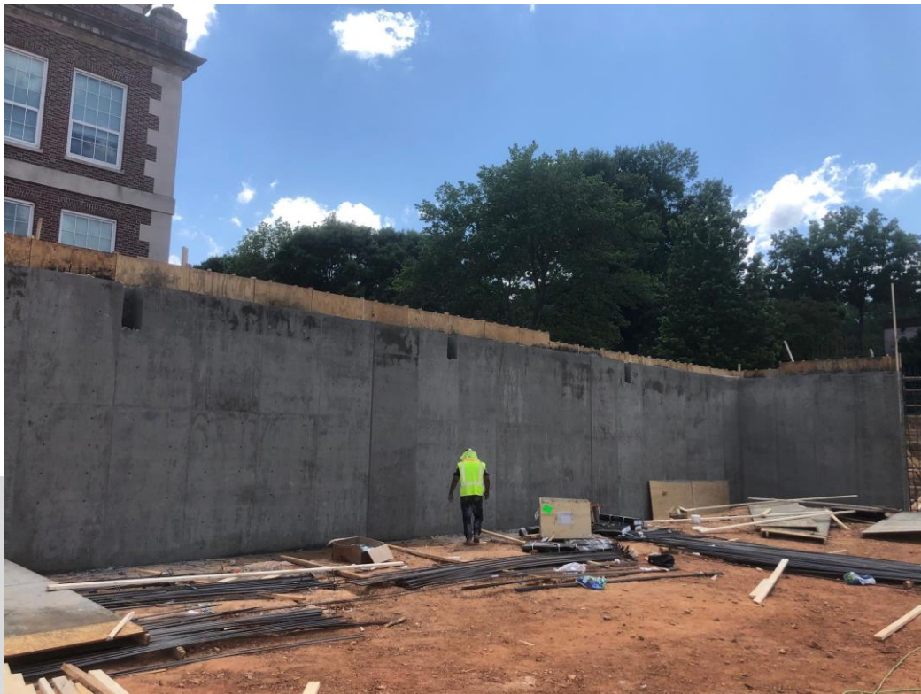
South Wall of New Addition