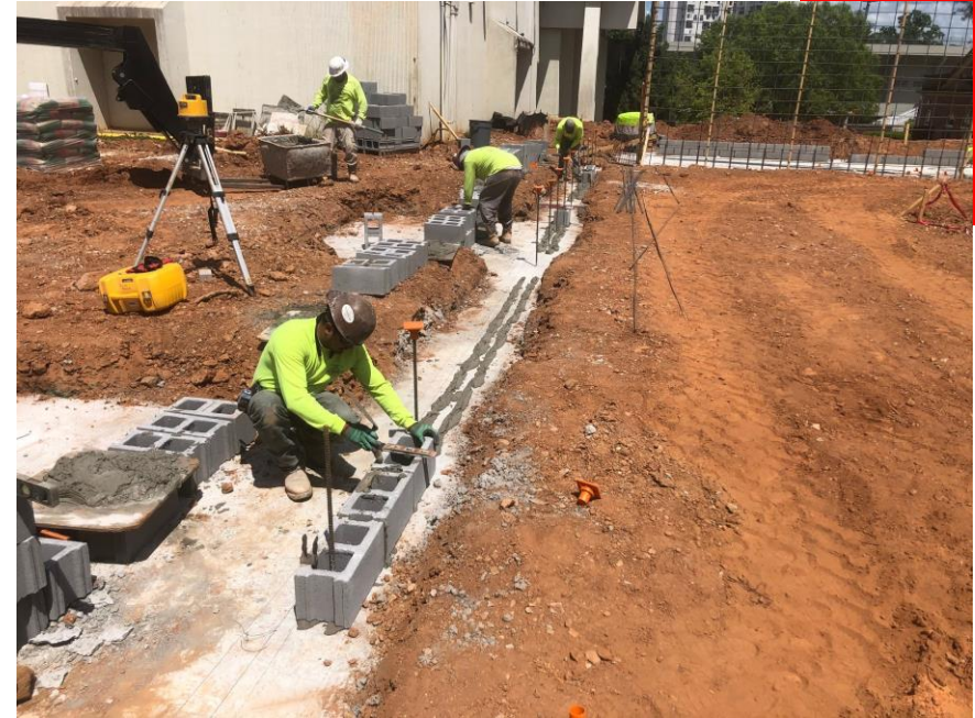
Installation of foundation block