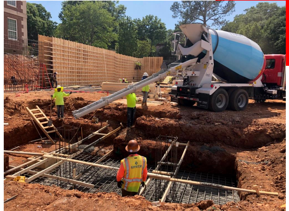
Pouring Elevator Pit for New Addition